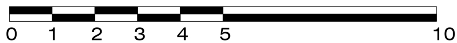
SCALE BAR 1:50